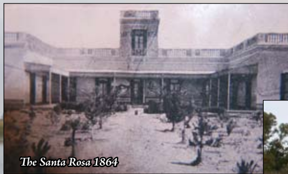
The Santa Rosa 1864

T he Santa Rosa, established in 1864, was the name of the breathtaking old world estancia, resembling a southern mansion with a Spanish flair. Wine, bread and cheese were awaiting us in the courtyard as our bags were unloaded. We soon realized that we were going to be treated like royalty, and it took a split second to come to a place of accepting this treatment with a thankful awe. A tour of this grand old world monument of a historical antiquity was given to me by